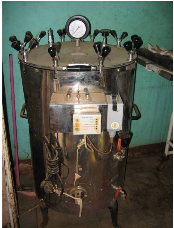
A new sterilizer unable to be used because the health center lacks the proper wiring.