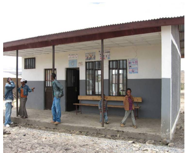
A typical health post.

In addition, each region maintains at least one reference laboratory; these facilities participate in the PEPFAR program and therefore are included in this report.