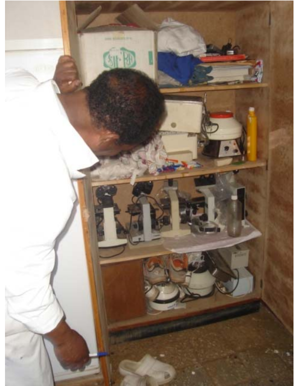
ABOVE: A closet full of non-functioning equipment at a health center in Amhara.

Electricity needs not integrated into planning: At all levels, from PEPFAR partners to health facility managers to government planners, electricity needs have not been integrated into health program planning. As a result, resources are not being maximized and malfunctioning equipment is negatively impacting health delivery. The impact could be particularly strong in new facilities being planned for construction outside the grid. Options for providing electricity to these facilities should be assessed before they are built so construction designs can accommodate the selected electrical system and bulk procurements of energy generating equipment can be conducted. However, interviews indicate that few of the regional planners have the ability to conduct this kind of analysis.