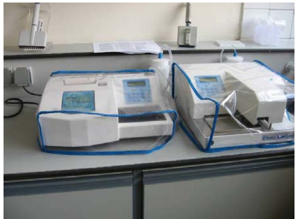
New equipment at the Oromia regional lab.

Laboratories in hospitals and regional laboratories will generally require more power, perhaps 6,000-12,000 watts, though the figure could be much higher for the regional labs. For example, the regional lab built for the National Laboratory in Haiti had multiple labs within the same building and each laboratory probably required 10,000 watts of power.