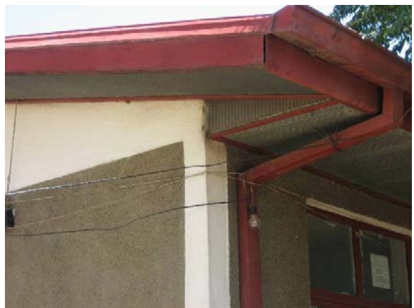
Inadequately sized and hung wire connecting buildings at a health center.

Aside from inadequate wiring between buildings, the wiring inside most of the buildings visited also is problematic. In many buildings the original wiring was installed for a few lights and small devices. As