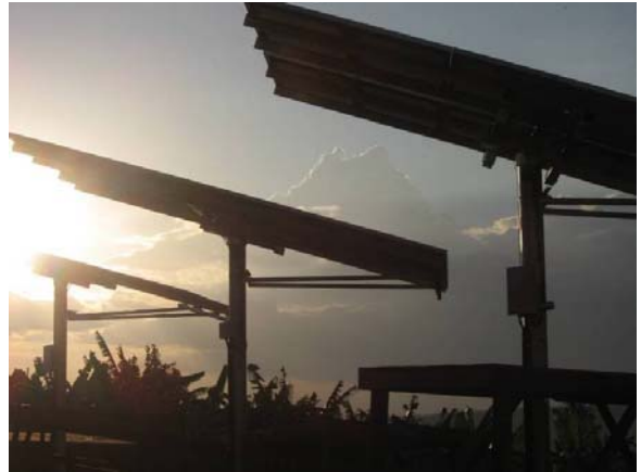
Solar panels at a health center in Rwanda.

A small- to medium-sized health facility likely would require a solar system to include a 3,000 to 6,000 watt array for all electrical needs. The cost of this equipment, with the batteries and inverters, would be $60,000 to $120,000. GTZ plans to equip 50-100 health centers with solar systems in the neighborhood of 1,000 watts, but this size system is unlikely to be able to address the full energy needs of the laboratory loads. The Energy Access Program supported by the World Bank and Global Environment Facility (GEF) will supply 200 health posts with 360 watt PV systems, but these will not power much more than lights. The program has already conducted international bidding and the finalist should be declared soon.