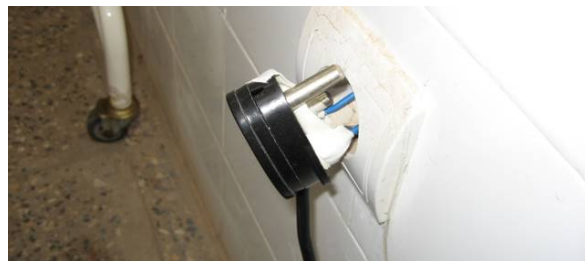
The pins on this autoclave plug have been taped so staff can try to use it in an inappropriate outlet.