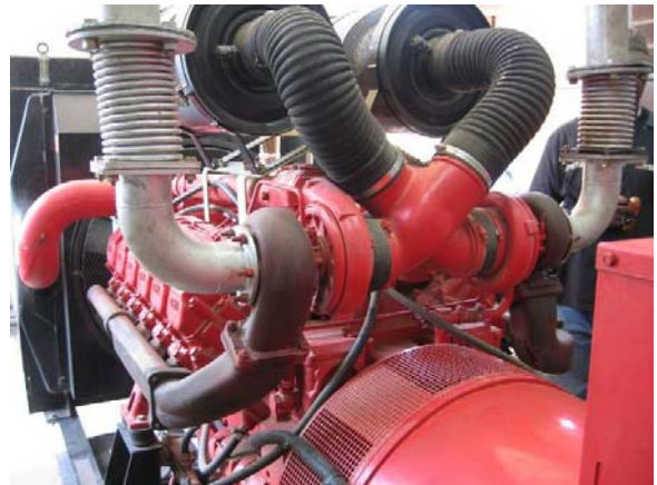
Gondar University Medical Center's new generator.

Generators can provide good quality power, but require regular fuel and maintenance. Capital costs of generators are fairly modest; a 7-10 KW generator (sufficient for a small to medium lab) can be purchased for about $7,000 to $12,000. If a site requires a generator as large as 30KW, this unit could cost in the neighborhood of $20,000. However, the cost of fuel and maintenance can overtake the initial purchase cost in a short amount of time, especially given current trends. Generators require someone on-site to provide routine maintenance.