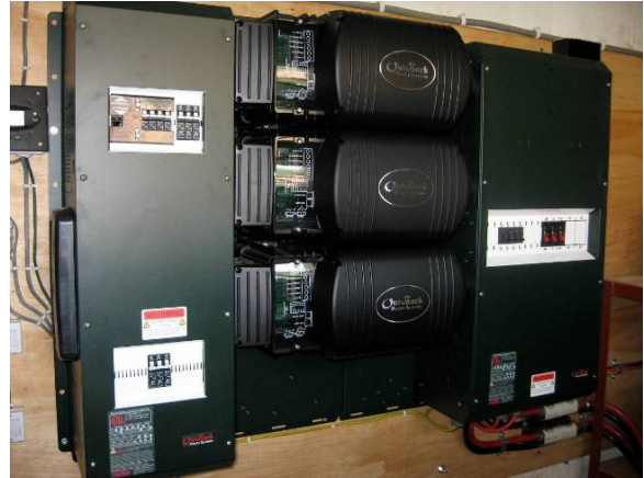
Inverters at a health center in Rwanda.

Inverter/battery systems also require considerable training to maintain; there should be an on-site person trained to perform daily maintenance tasks, with periodic (more specialized) maintenance performed by a specialist. If the latter does not exist, local capacity will need to be built to ensure sustainability of the systems.