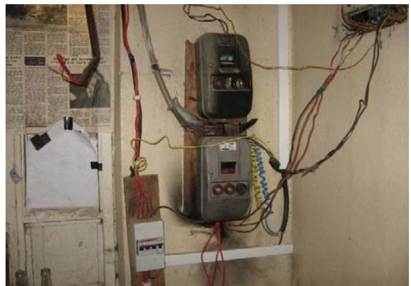
Wiring at the Amhara Regional lab, with evidence of an electrical fire.